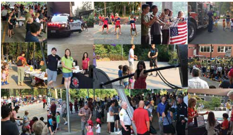
The Eighth Annual Night Out was enjoyed by over 300 residents! Special thanks to all the sponsors who came to the event. Neighbors appreciated getting to know the visiting businesses and food sponsors. Thanks to All of Our Sponsors and Friends!

BTNO is an annual event hosted by the Bridle Trails Community Club. Plan to join this excellent community event at Cherry Crest School in August 2018.